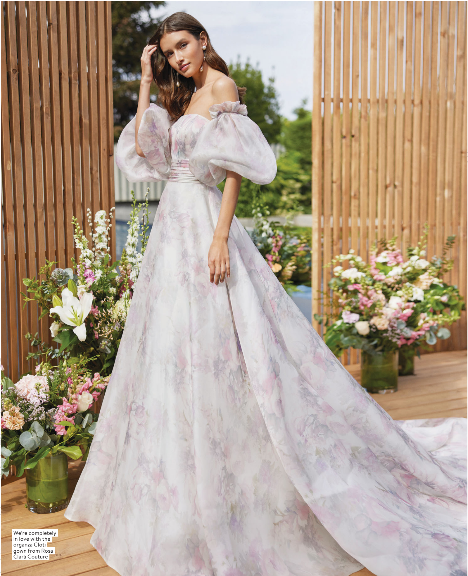
We're completely in love with the organza Cloti gown from Rosa Clará Couture