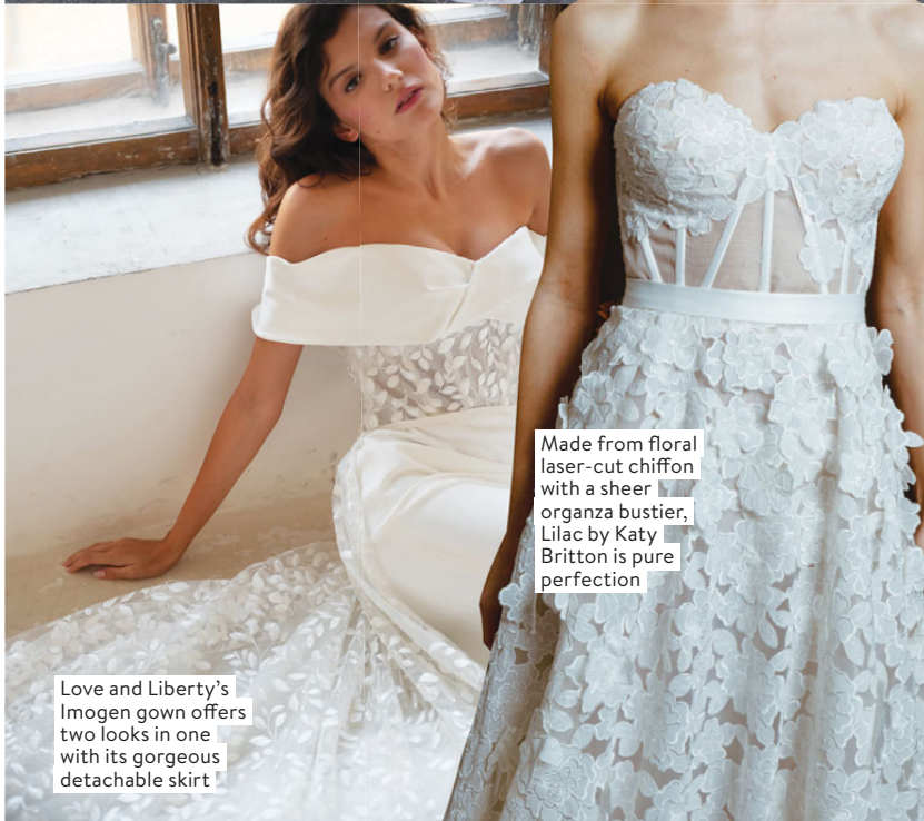
Love and Liberty's Imogen gown offers two looks in one with its gorgeous detachable skirt