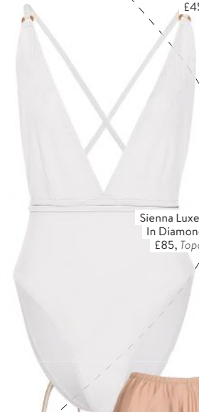
Sienna Luxe Swimsuit In Diamond White, £85, Topaz Luxe