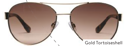
Gold Tortoiseshell Aviator Sunglasses, £45, Crew Clothing