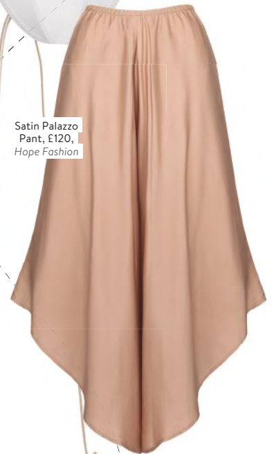
Satin Palazzo Pant, £120, Hope Fashion