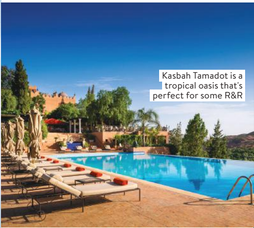
Kasbah Tamadot is a tropical oasis that's perfect for some R&R