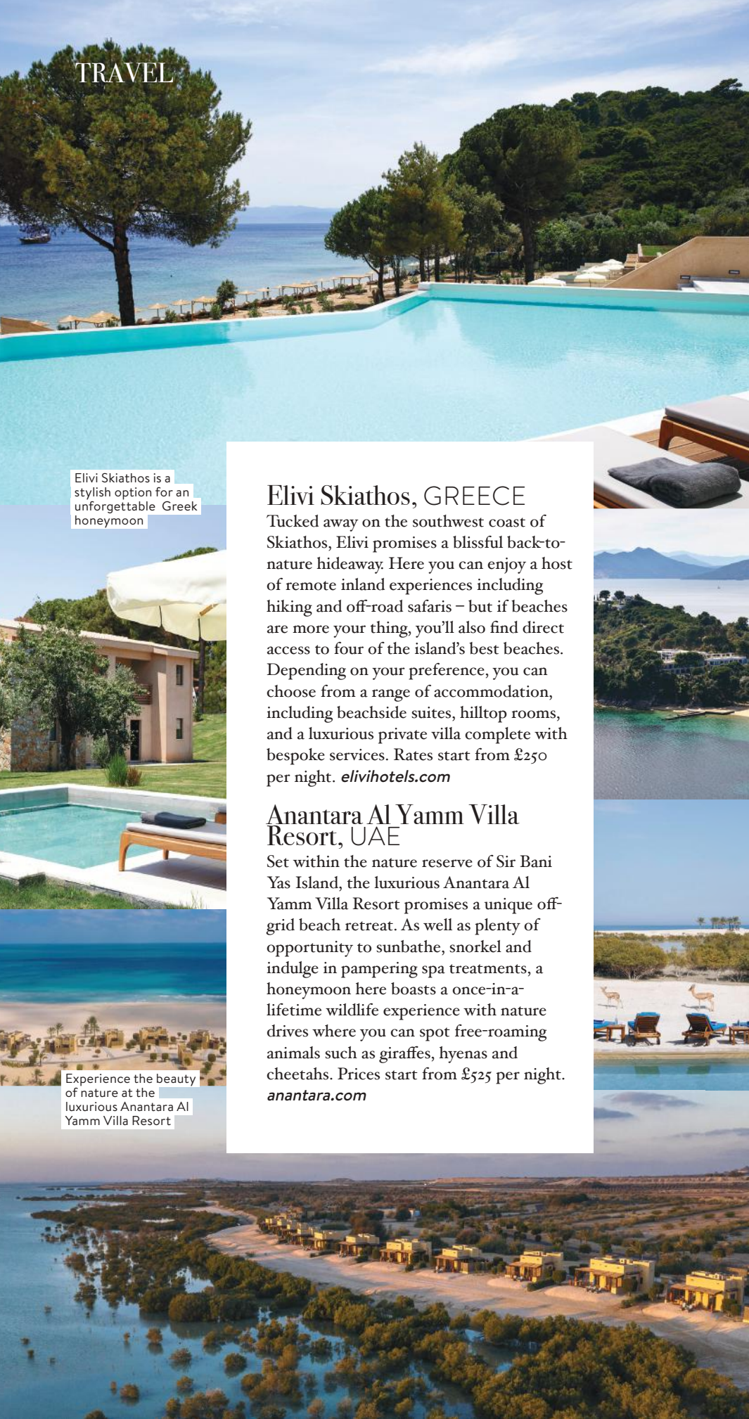
Elivi Skiathos is a stylish option for an unforgettable Greek honeymoon