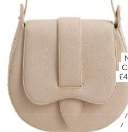
Nova Studded Crossbody Bag, £46, Oliver Bonas