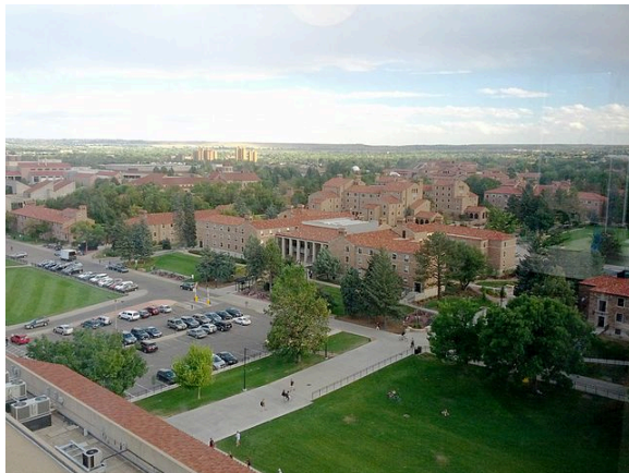
CU Boulder main campus which houses 31,103

schools from 1998 to 2021. Emily Friesen