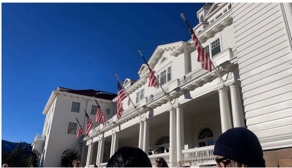
The main building at the Stanley Hotel; however the hotel is also home to a casino, airstrip and shooting range. Emily Friesen