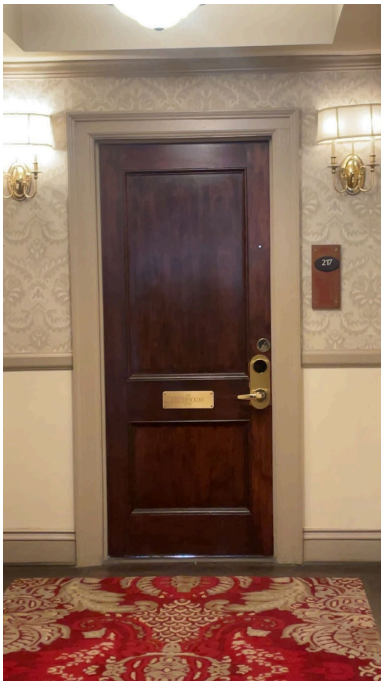
The notable room 217 pictured is the only door with a wooden plaque to deter guests from stealing the number. Emily Friesen