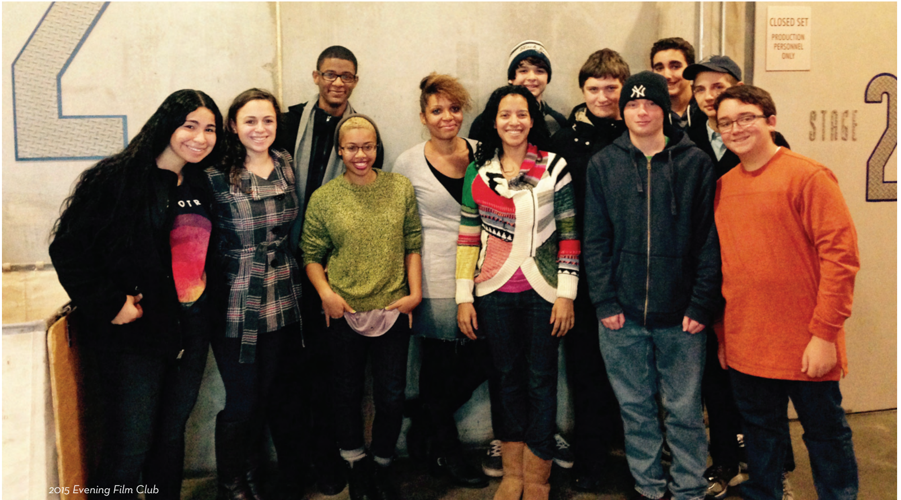
2015 Evening Film Club

2015 RESIDENCIES: BOYS AND GIRLS CLUB OF NEW ROCHELLE - DOCUMENTARY FILMMAKING • BOYS AND GIRLS CLUB OF MT. VERNON - DOCUMENTARY FILMMAKING • COLONIAL SCHOOL ELEMENTARY - ACTING AND ANIMATION WORKSHOPS • THE MILTON SCHOOL - A TASTE OF FILMMAKING • PROSPECT HILL ELEMENTARY - NATIVE AMERICAN PROJECT & A TASTE OF FILMMAKING • SIWANUY ELEMENTARY - PERSONAL NARRATIVE & 5TH GRADE GRADUATION PROJECT