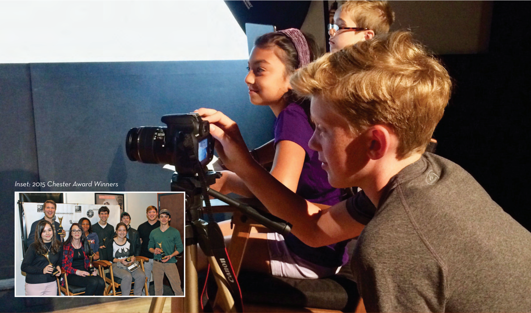
Inset: 2015 Chester Award Winners