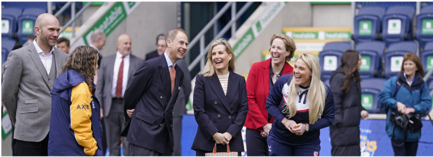
The Duke and Duchess of Edinburgh spectate female Rugby League trials at Headingley Stadium.