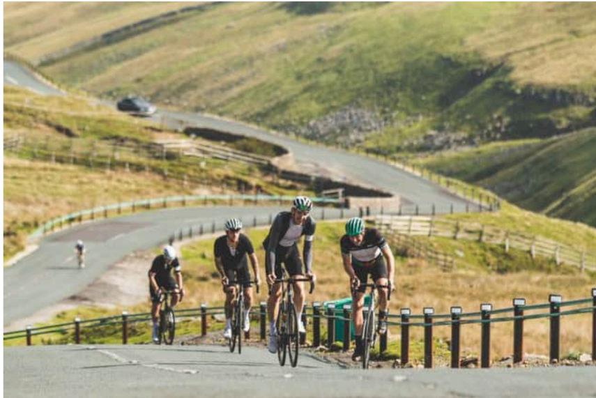
Cyclists tackle the hill of Buttertubs pass- a high road in the Yorkshire Dales.