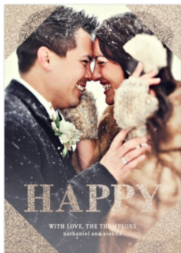
"Radiant Charm" pearl glitter holiday card from Tiny Prints

No matter what you're looking for — from Thanksgiving, Christmas, Hannukah and other holiday cards to birthday party invitations to personalized note cards — Tiny Prints has it. As our top-rated site, this service is great for customization and offers tons of coordinating add-ons to complement your choices. Rather than offering a smorgasbord of discounts on different types of items, right now Tiny Prints is making things simple: you get 25% off any order, no minimum purchase necessary, with the coupon code SHINE25. This extends to Tiny Prints business orders, for anyone who wants to update their business cards or order some corporate holiday cards to hand out. The discount ends Nov. 11.