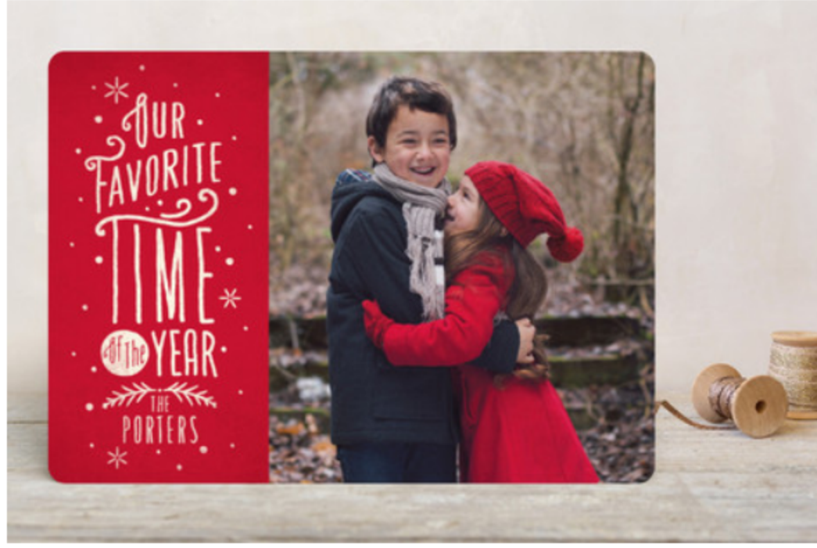
"Our Favorite Time" holiday card from Minted

customize your picks so they are completely you. Right now, you can get a $25 discount on Holiday cards from Minted using the code BRIGHT25 at checkout. The best part about this deal is that there isn't a minimum purchase required to take advantage of it — so go shopping and have some fun! This offer is valid through Nov. 9 .