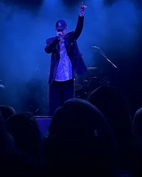
eaJ Park by Kya Brogdon

were obvious in the way he sang the words "Promise me, I'm not too much / Not too much for you."