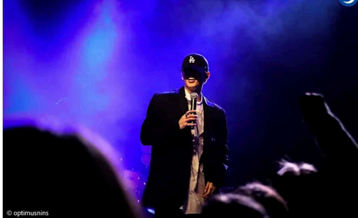
eaJ Park

Thank you for an incredible night, Jae. Jars are forever proud of you, and we will never be ashamed to say "that's my singer."