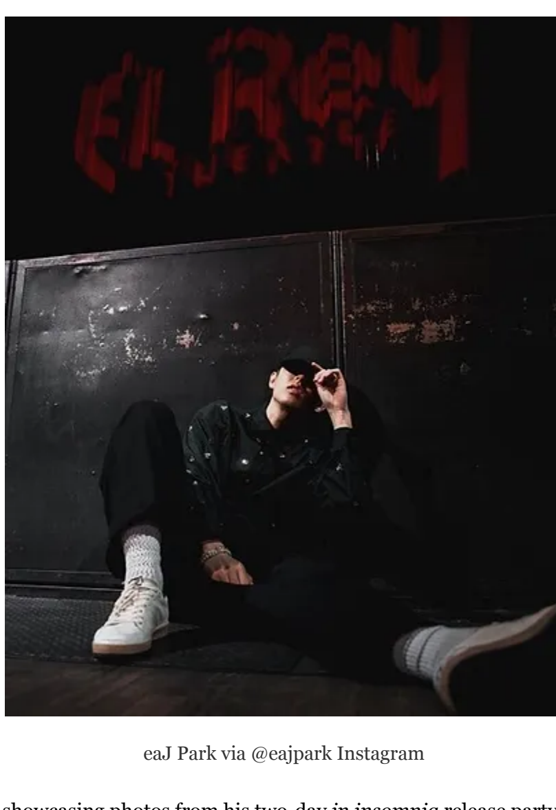
eaJ Park

"Last weekend was a dream" is the caption of eaJ's Instagram post, showcasing photos from his two-day in insomnia release party held at the El Rey Theatre in Los Angeles. Held in celebration of his trilogy of EPs released this year - laughing in insomnia , smiling in insomnia , and medicated insomnia - the concert felt like a perfect amalgamation of everything eaJ and Jars have been hoping for since the release of "Car Crash" back in April of 2022. I've been a fan of Jae since his time in Day6, and after seeing him play at Head In The Clouds in 2021, I knew I had to do anything I could to secure a ticket for any solo show he would end up doing. Thankfully, with the help of a friend, I was able to score a ticket to the first night of the shows.