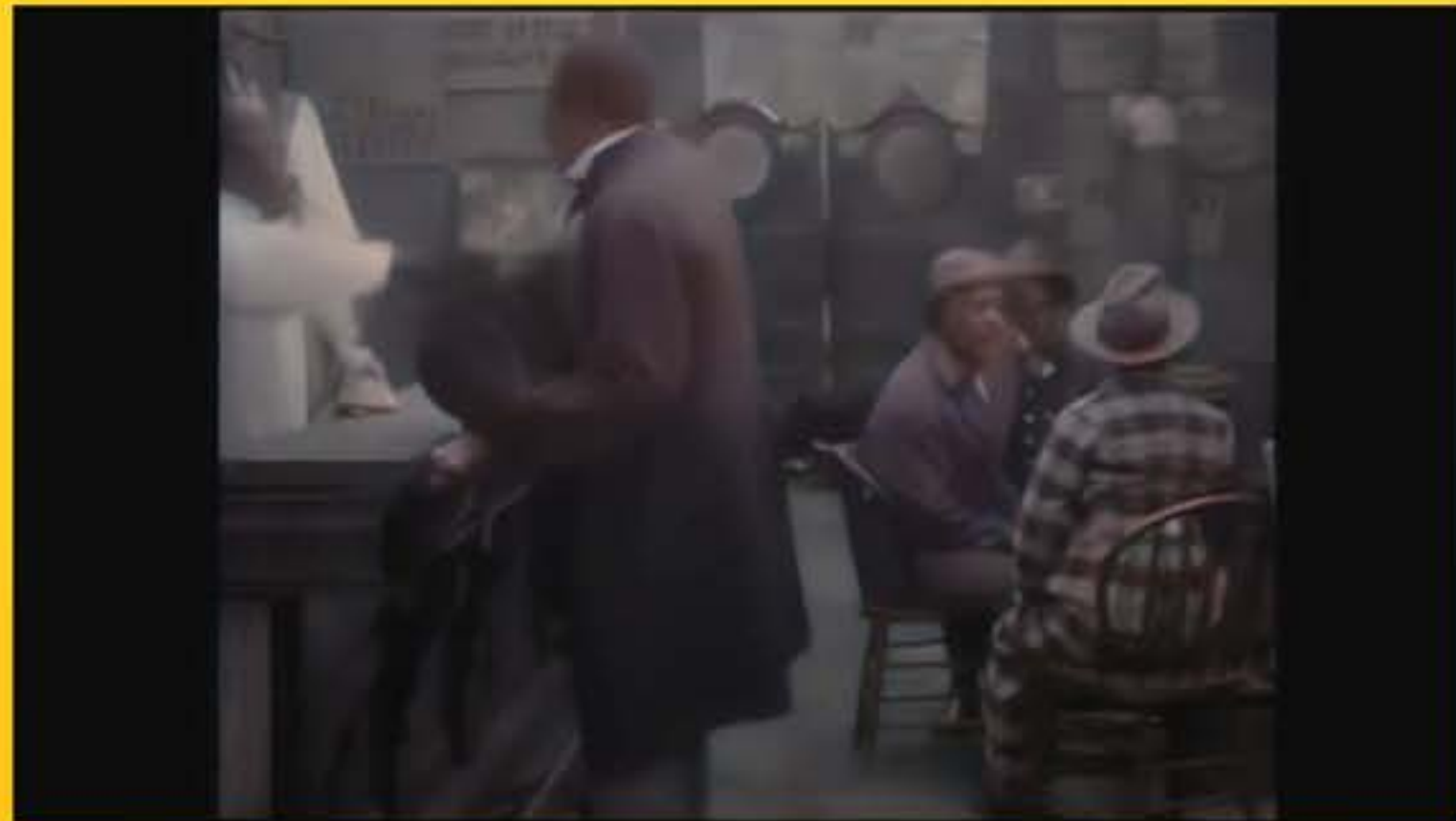
Bert Williams _A Natural Born Gambler