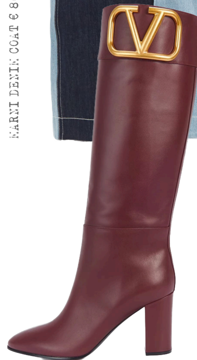
VALENTINO RED BOOTS € 1200