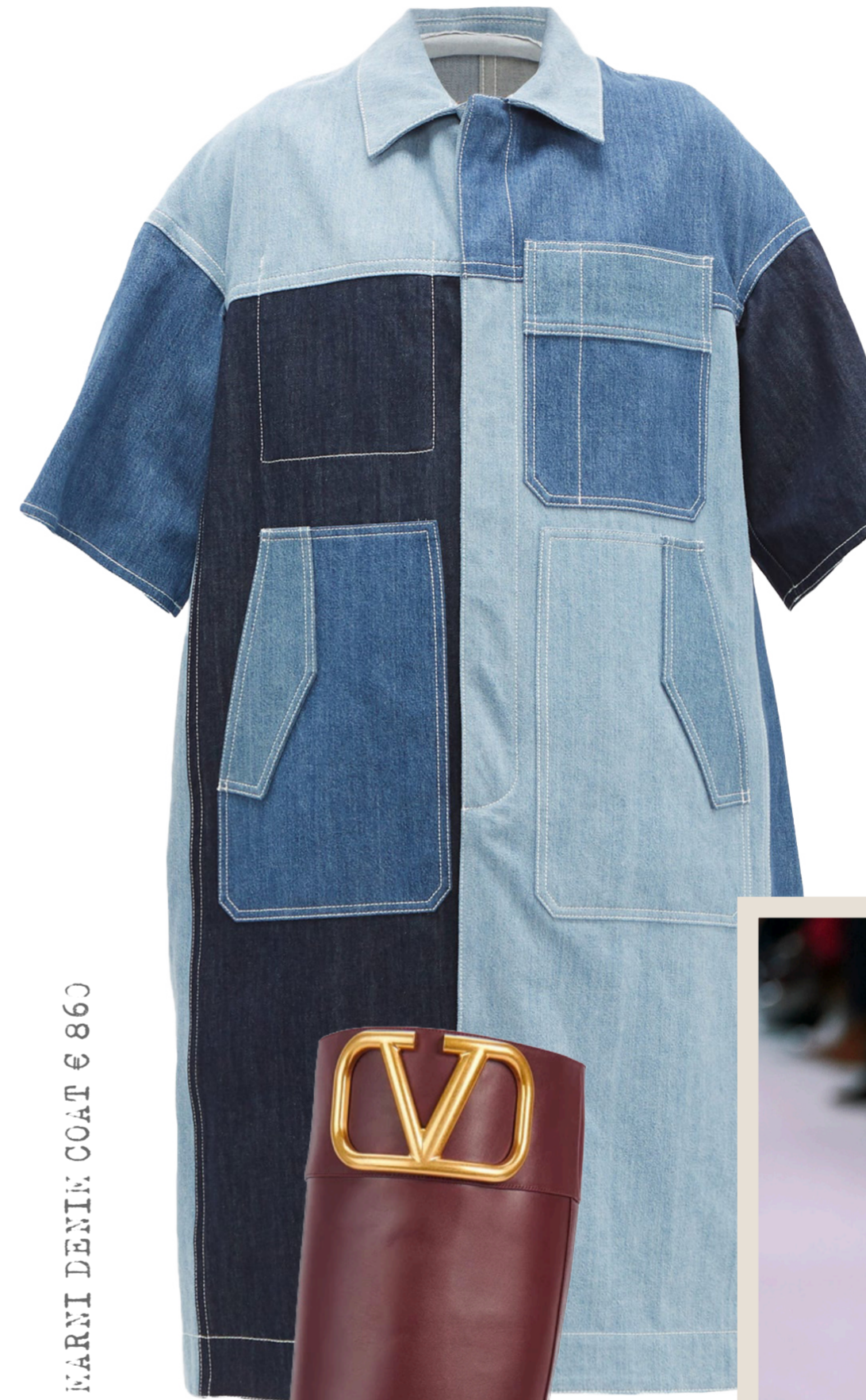
MARNI DENIM COAT € 860