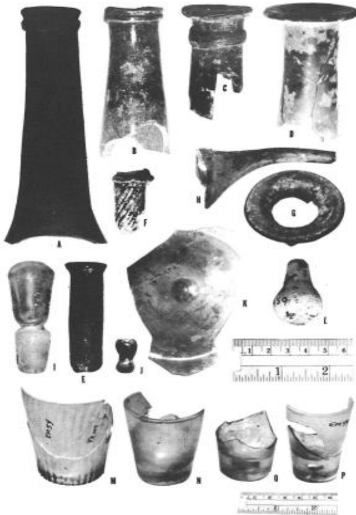
Figure 4 Glass: A-F: Bottle necks. G: Bottle lip, H: Piston, I, J: Bottle stoppers, K: Bottle kickup, L: "Tear glass", M-P: Tumblers.

Afro-Caribbean and Morro ceramic goods (assuming that 'Rey Ware' is a French or British type introduced to Puerto Rico) were manifested mainly after trade embargoes had a corresponding increase in this ceramic that could be predicted. K. Deagan notes that 'King Ware' bears a strong resemblance to 'Red Ware' and it has been noted that 'King' wares are found mainly in those colonies engaged in the Triangle trade.