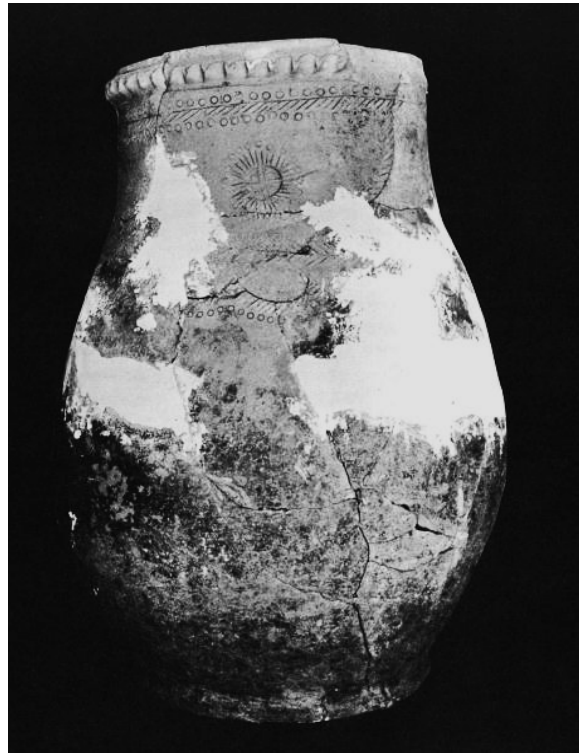
Figure 3: Ceramic vessel of unknown origin, found in the kitchen courtyard .Height 22.5 inches, greatest diameter 14.5 inches.

El Morro was redefined by Hale Smith through excavations at the historic Fort San Juan. The analysis coincides in postulating that these ceramics were manufactured locally, although Kathleen Deagan points out that their presence in San Agustín suggests that they were manufactured in Puebla or Havana. This in turn suggests that the origins of these located supplies are more of a Caribbean product. The nature of the political organization in El Morro as a highly interwoven institution had been formed in the urban tactical centers to serve as a bridge for clandestine sectors between official sectors with the support of public opinion from the sectors with greater economic power.