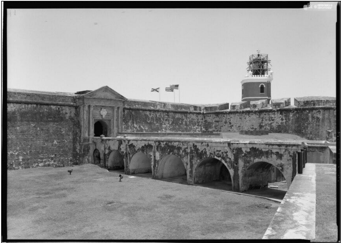
Main gate and the lighthouse in 1933. (Library of Congress Prints and Photographs Division Washington).

within the range of social themes and intellectual problems that include colonialism, contact, globalization, power and the complexities of slavery and freedom. A dynamic conception of the historical-social development of El Morro confirmed a degree of architectural validity and amplification of the means of dissemination and disclosure with a comparative exegesis through logic and congruence.