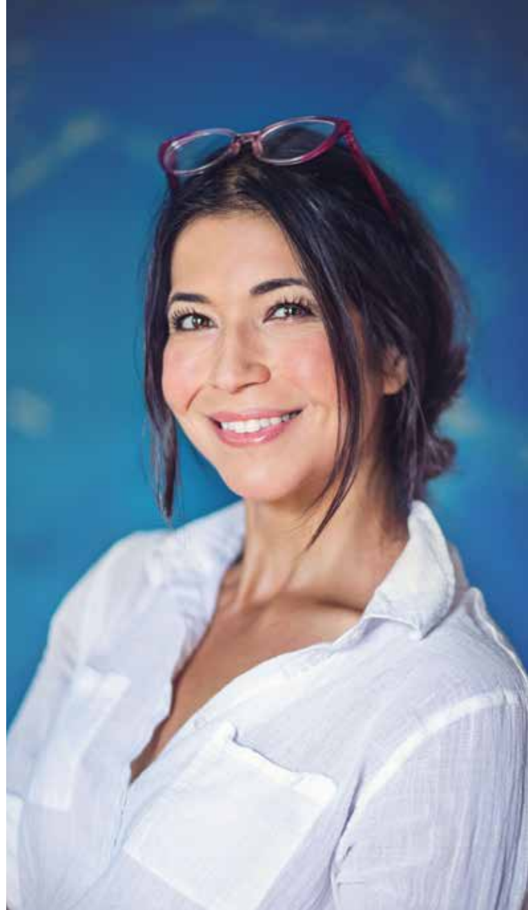
Book 1: Year of the Ram

Nurture your creativity, in whatever form. Pursuing our passions infuses life with meaning. Be open to intuition—your own, or advice you receive from someone you trust. I discovered Chinese brush painting years earlier and completed many pieces during my father's illness. I always saw it as a hobby. His final words urged me to sell my paintings, revealing a deeper purpose to my art. Many are now the essential framework to my book.