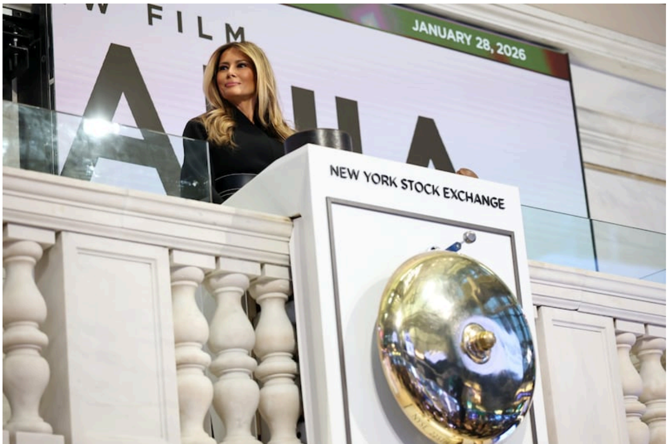
The first lady rang the opening bell on Wednesday ahead of her movie release.

The NYSE also gave her a "commemorative plate."