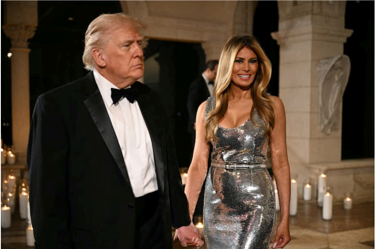
Melania hosted a private screening of her new movie at the White House on Saturday night.