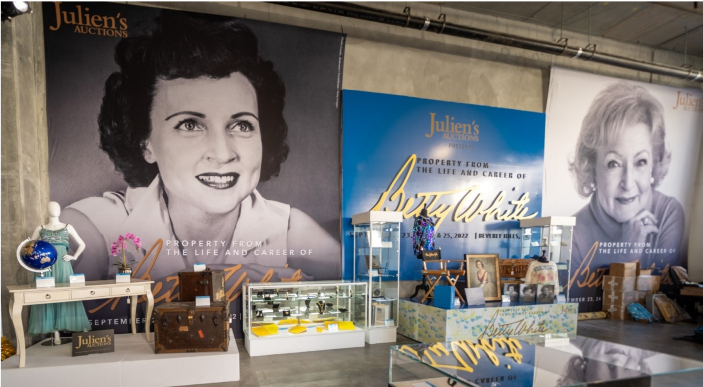
Betty White Estate Auction