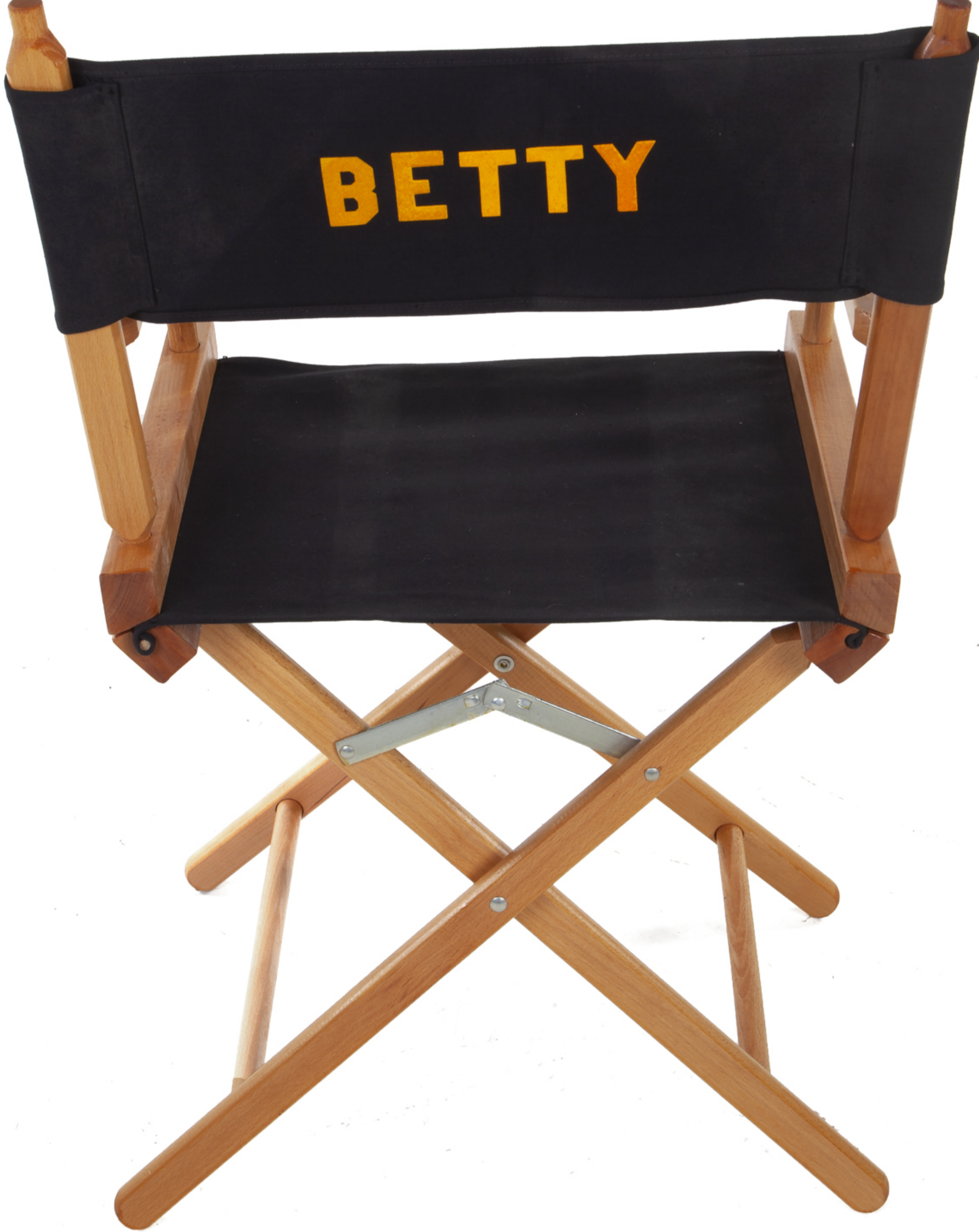
Betty White's original director chair from The Golden Girls (Touchstone Television, 1985-92)