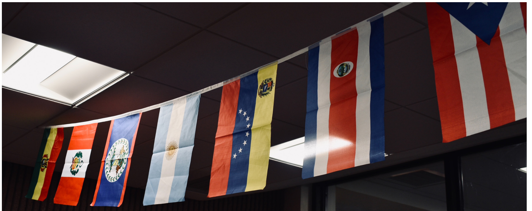
Flags in the LALCC.