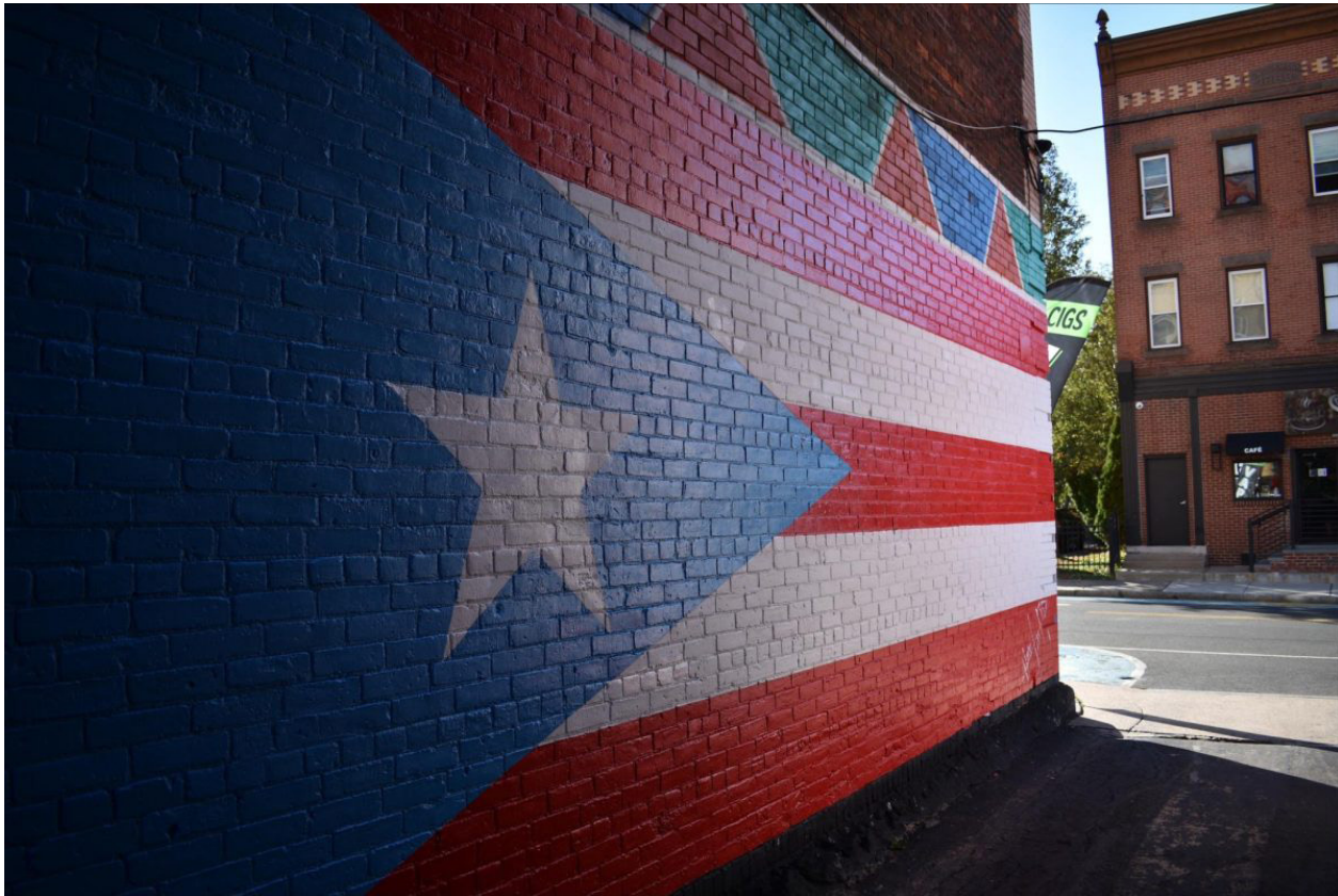
Barrio-Latino, New Britain