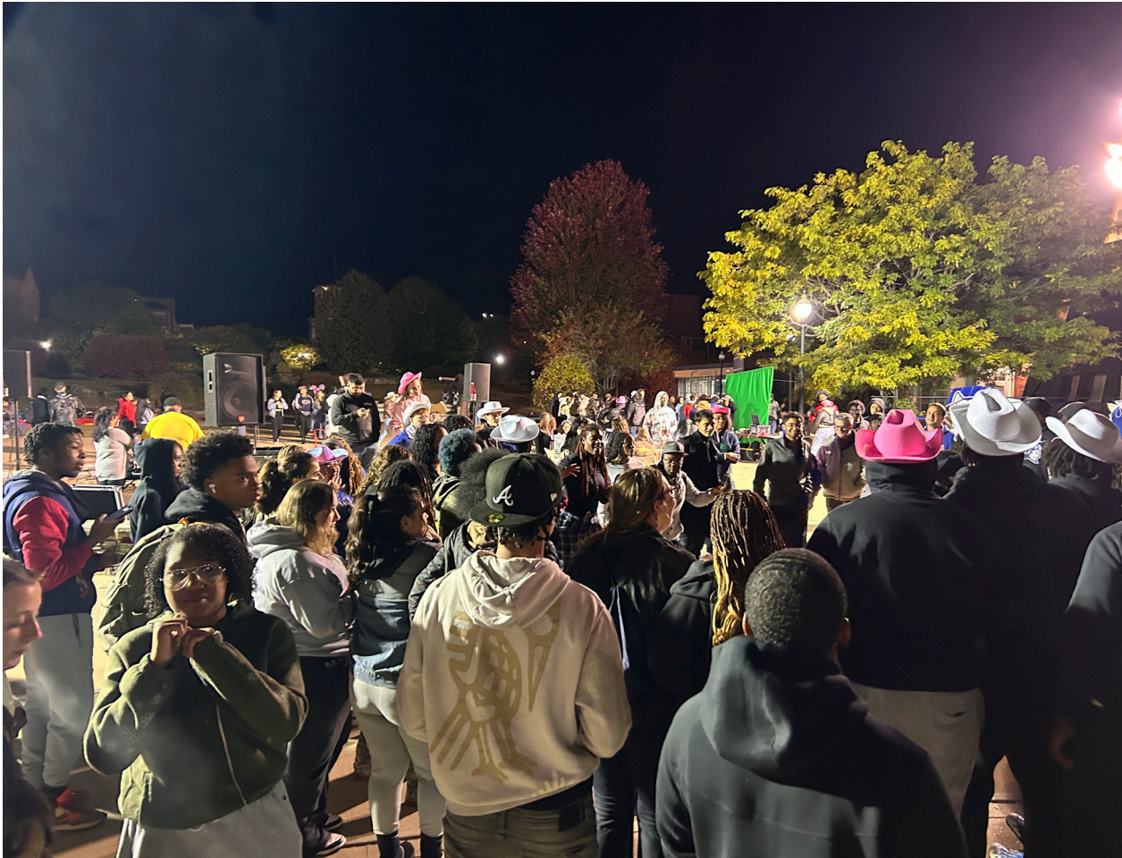
Students gathered near the CCSU Student Center.