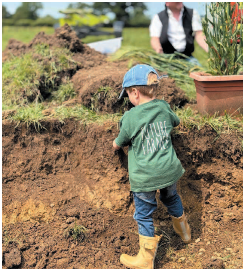
It's a day out for the whole family.

for the first time last year. 'Farmers are often pushed for time, but when you do get hold of one, I guarantee they won't stop talking about farming!' he laughs. 'Education is so important, and if you only manage to talk to 10 per cent of the visitors, and they only take away one piece of information, you've still made an impression.'