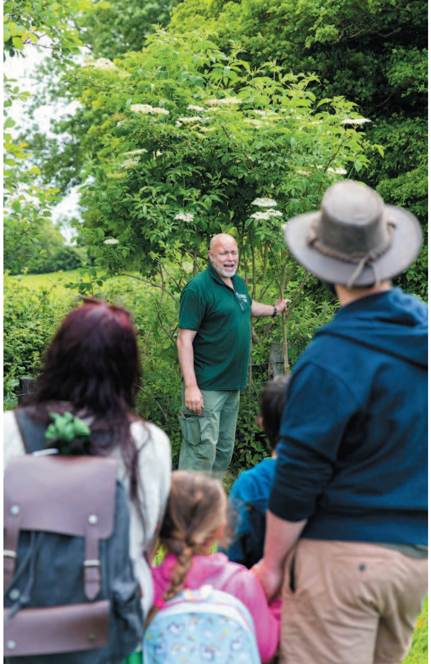
From vineyard tours to tractor rides there's something for the whole family.