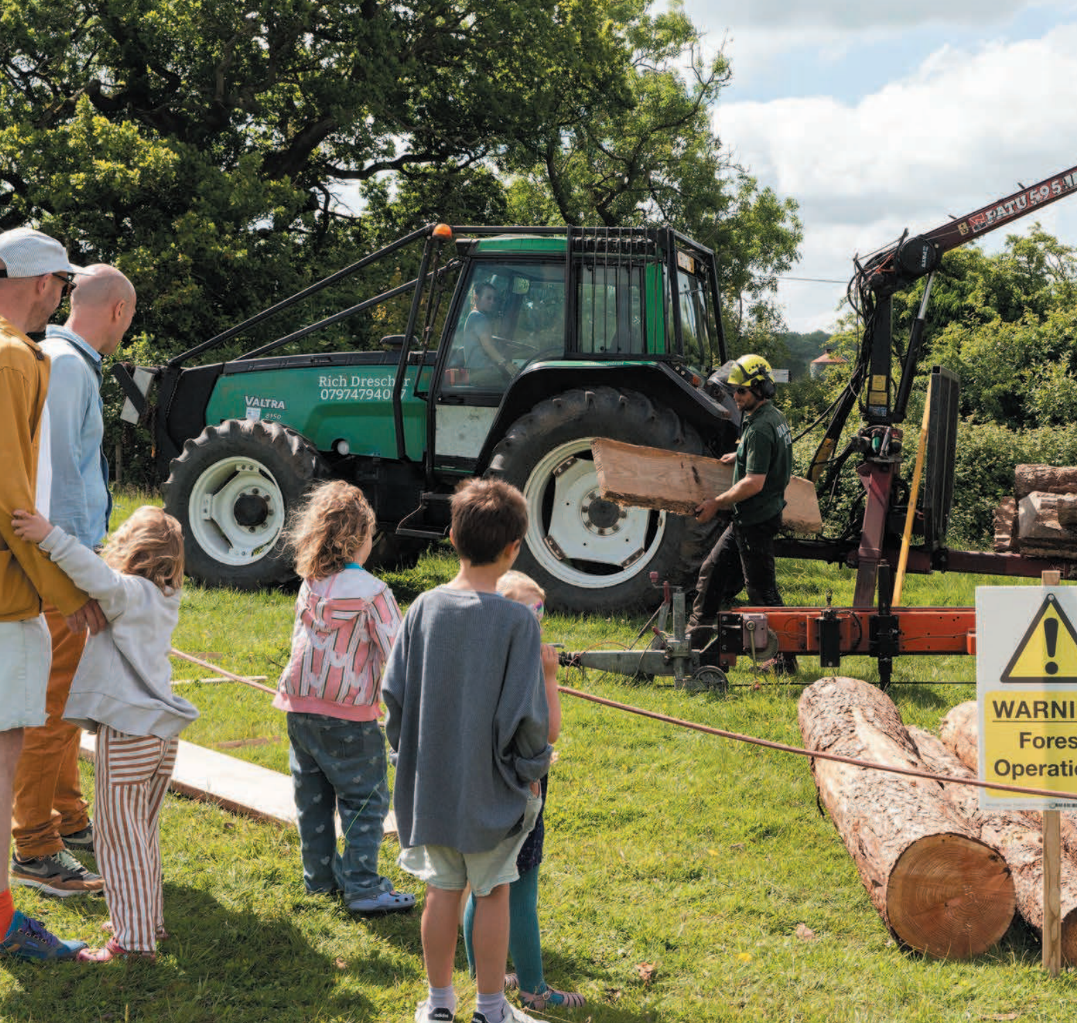
All sorts of farming activities are demonstrated on Open Farm Sunday.

eat as many as 17 a day when rearing young. It's about explaining these connections to people: why we need bees and wasps in the orchard, why we don't spray, the things that make it tick. Being able to explain that helps cement the connection between the public and where their food comes from.'