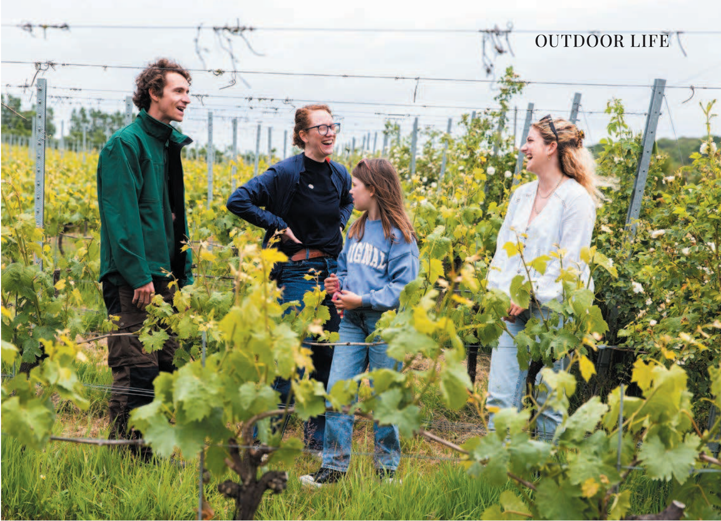
Vineyard tours will be offered at Durslade Farm as part of Open Farm Sunday.