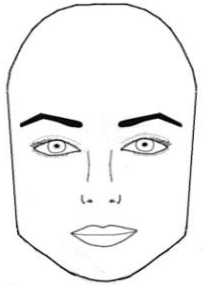
Square Face Shape