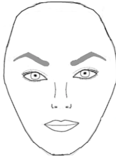
Diamond Face Shape