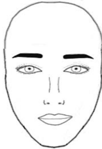
Long Face Shape