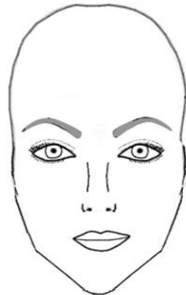
Heart Face Shape