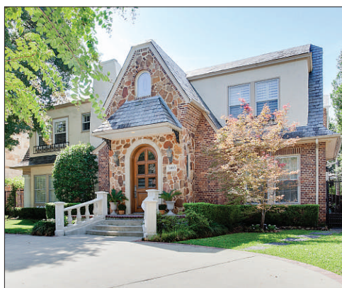
The home at 3405 Princeton will be held open from 2 to 4 p.m. today, part of the Realtor Nationwide Open House Weekend.

To make it convenient to see the diverse home choices available throughout North Texas, Virginia Cook Realtors is participating in the Realtor Nationwide Open House Weekend. Many of the homes listed See COOK on Page 7H.