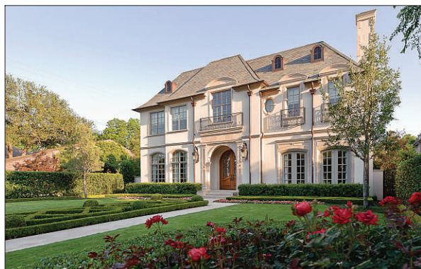
This classic French Provencal home at 3801 Normandy includes spectacular living and entertaining spaces.

A highlight of this French-style home is the 700-bottle wine room with rich woods, iron fixtures, worn brick flooring and a sturdy tasting table. This room is just off the limestone floored entry with its sweeping hand-scraped wood staircase, including See BRIGGS on Page 5H.