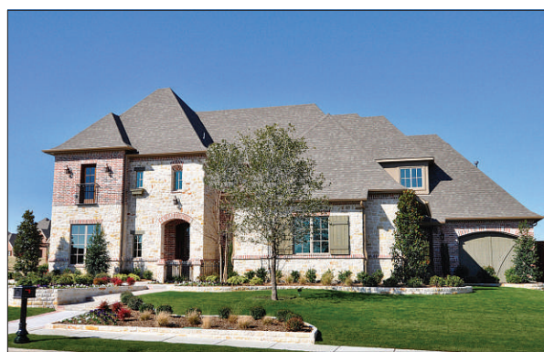
Most floor plans at Windsor Homes' community in Allen feature rooms such as playrooms, mudrooms, studies and media rooms.

Windsor Homes has announced the grand opening of Phase II in Cumberland Crossing.