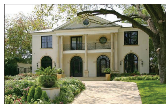
The home at 3405 Princeton will be held open from 2 to 4 p.m. today, part of the Realtor Nationwide Open House Weekend.

The three-story, approximately 11,800-square-foot home provides six bedrooms, seven baths, two half-baths, eight gathering areas, five refreshment