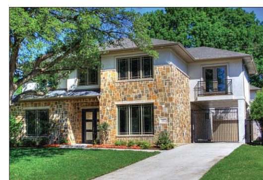
Homes in the Lakewood area will be held open from 2 to 5 p.m. today, including 6845 Southridge.

"We are very busy with our build-to-suit homes, due to our full-service ap-