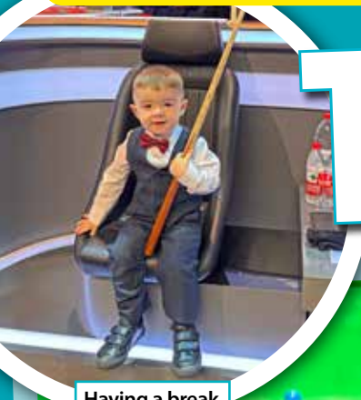
Having a break