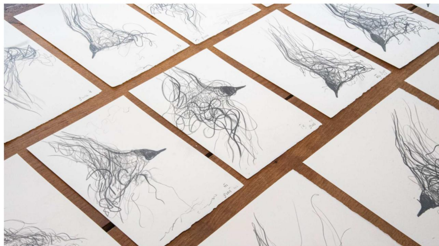
Jason Gathorne-Hardy's seagull drawings