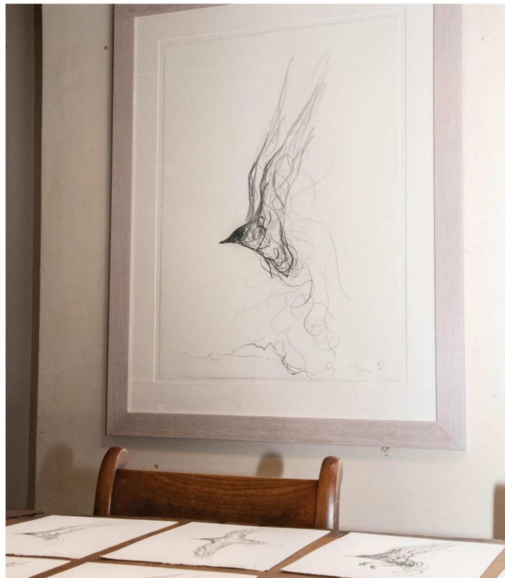
Jason Gathorne-Hardy's seagull drawings