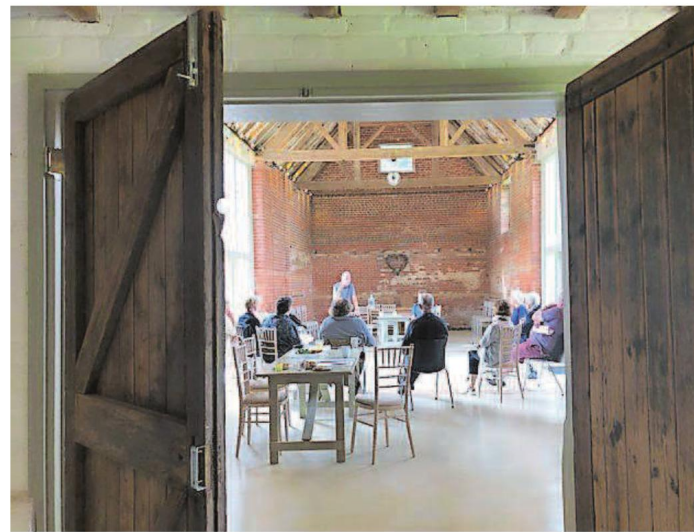
The first Stage and Page writing workshop at Shimpling Park Farm

"I actually started life as a poet, but on the advice of Nobel Prize-winning poet Derek Walcott who I worked with, I decided in my early