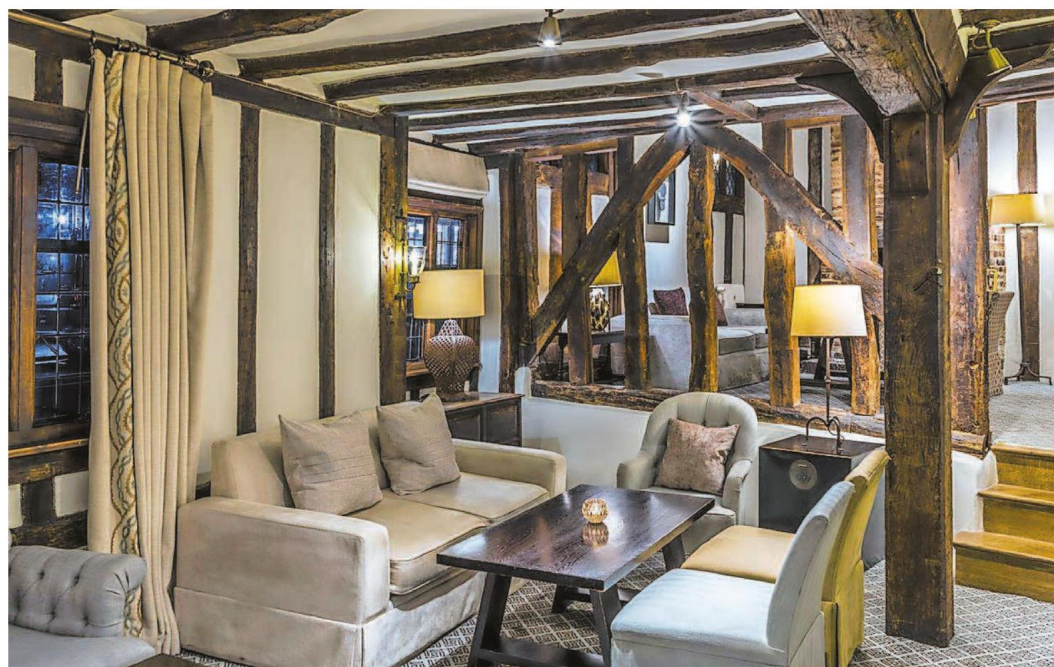
Inside The Swan at Lavenham