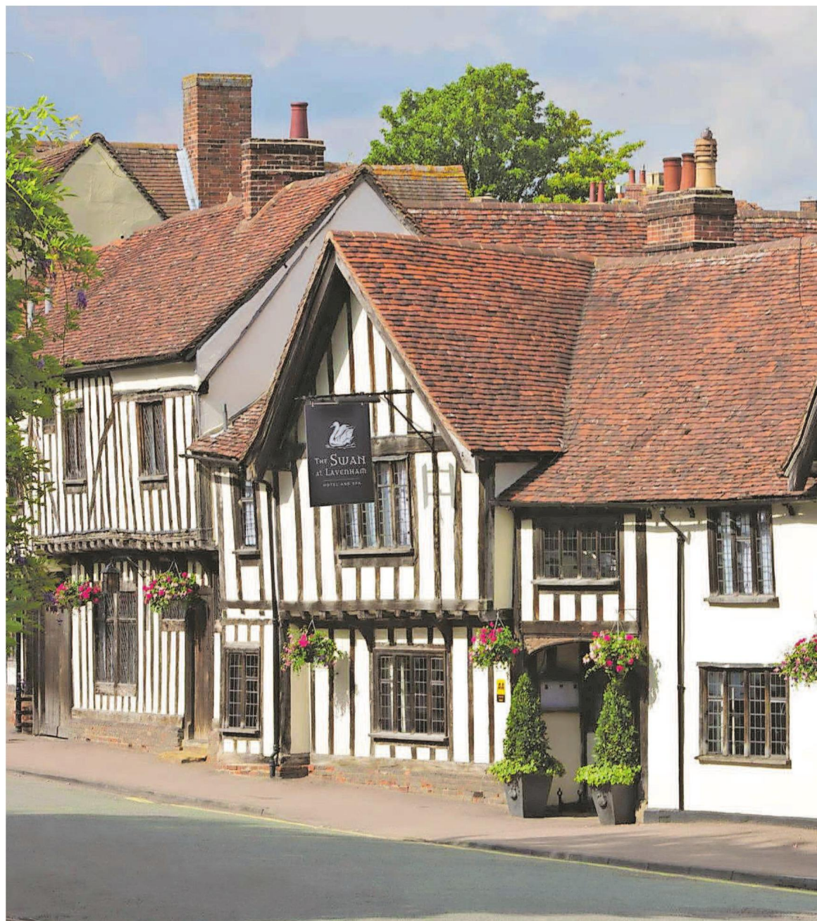
The Swan at Lavenham

"I am hopeful that 2023 will be the year that the underlying apprehension of the past few years can be put to one side and