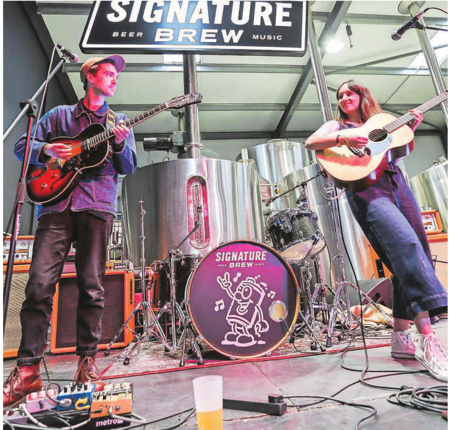
Above, Me and The Moon at Signature Brew Live