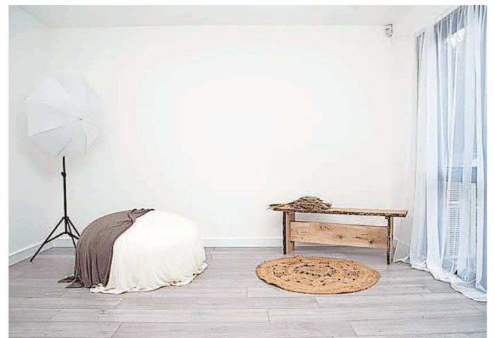
Some of the equipment and facilities on offer at Illuminate