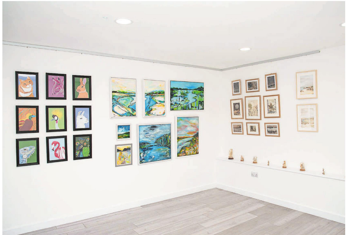
There is also a gallery at Illuminate, where artists can showcase their work

photography, hobbyists and professionals. The aim is to create an inspiring and comfortable space for artists and creatives to learn, develop and push the boundaries of analogue photography.”