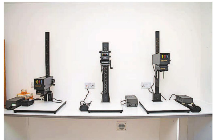
Some of the equipment and facilities on offer at Illuminate

To find out more about Illuminate, visit illuminatestudio.co.uk