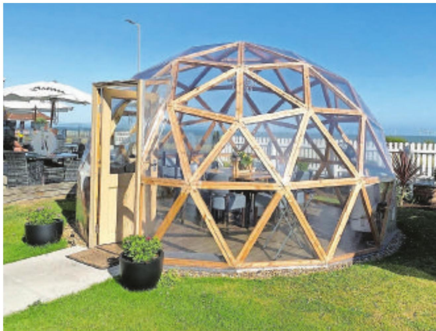
BELOW: The dining pod at The Kingscliff Hotel

in white wine paprika and garlic, lemon and dill gratin and chorizo butter - and they were absolutely heavenly. The flavours were fantastic and they were cooked to perfection.