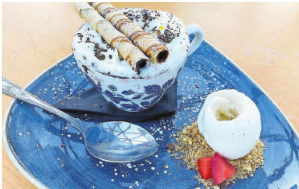
Cappuccino chocolate fondant pudding