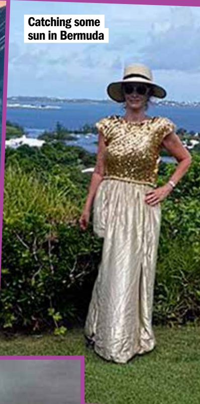
Catching some sun in Bermuda