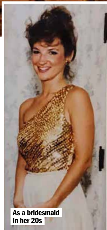
As a bridesmaid in her 20s