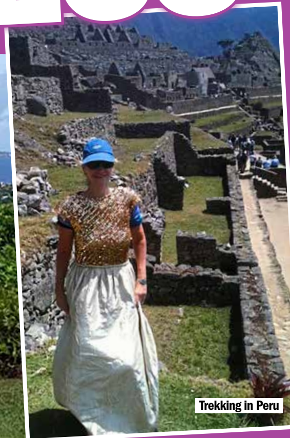
Trekking in Peru