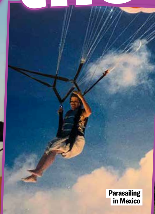
Parasailing in Mexico