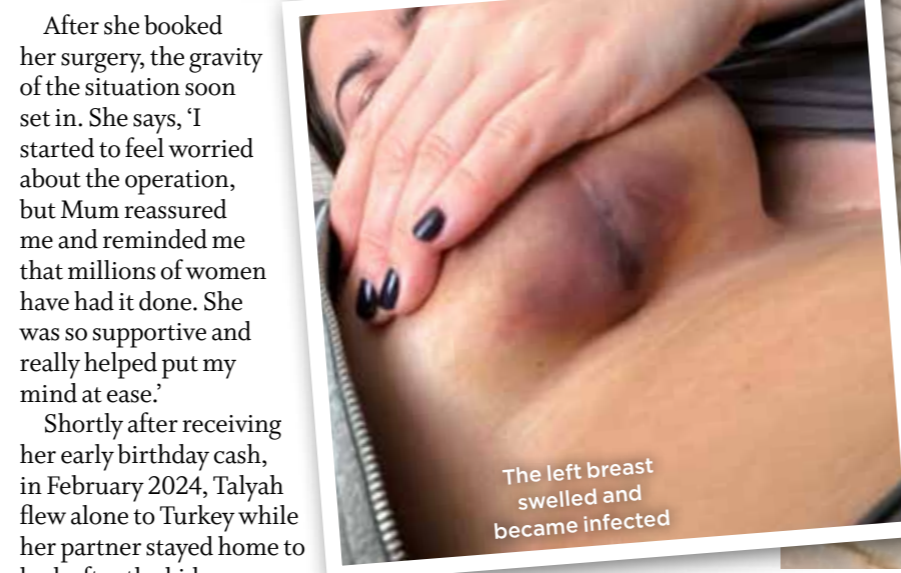
The left breast swelled and became infected

After she booked her surgery, the gravity of the situation soon set in. She says, 'I started to feel worried about the operation, but Mum reassured me and reminded me that millions of women have had it done. She was so supportive and really helped put my mind at ease.'