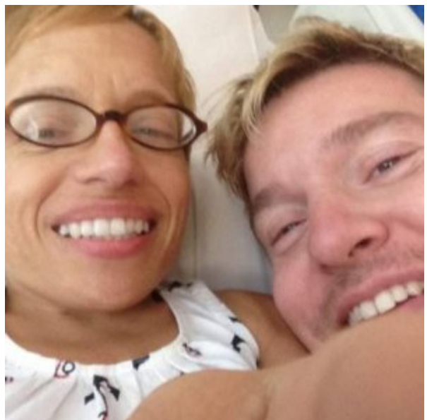
Things You Never Knew About the Stars of 'The Little Couple'