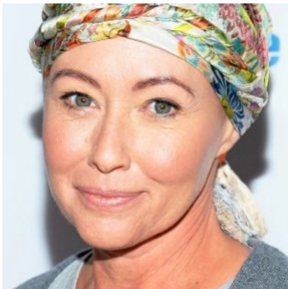
Shannen Doherty Gives Sad Cancer Update