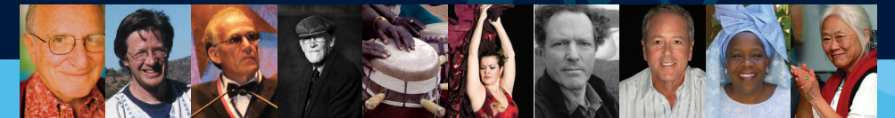
Distinguished Visiting Scholars 2009–2010

The College of Arts & Sciences at Suffolk University cordially invites you to meet acclaimed scholars, prize-winning poets and authors, world-renowned performers, and educators and activists tackling some of the most pressing issues of our time.