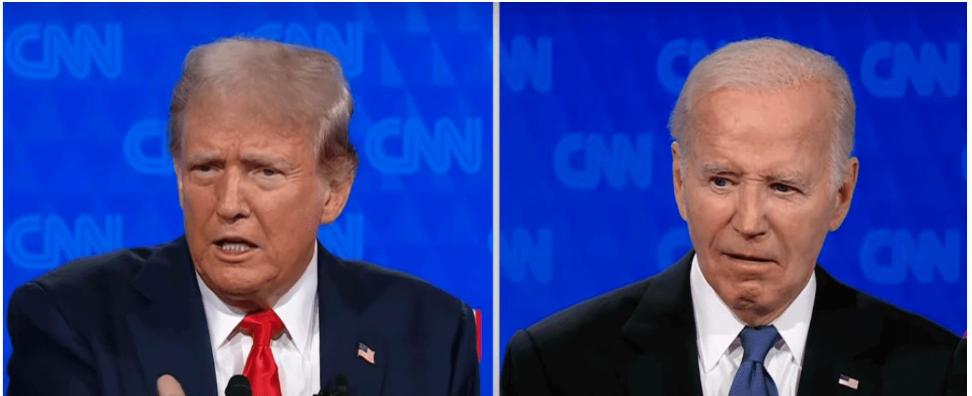
President Joe Biden and Former President Donald Trump debate on Thursday

WASHINGTON, D.C. — U.S. Sen. Chris Murphy was the only Connecticut lawmaker who turned to X during last night's CNN-hosted presidential debate, slamming former President Trump for his false claims and response to the Jan. 6 U.S. Capitol rioters in 2021.