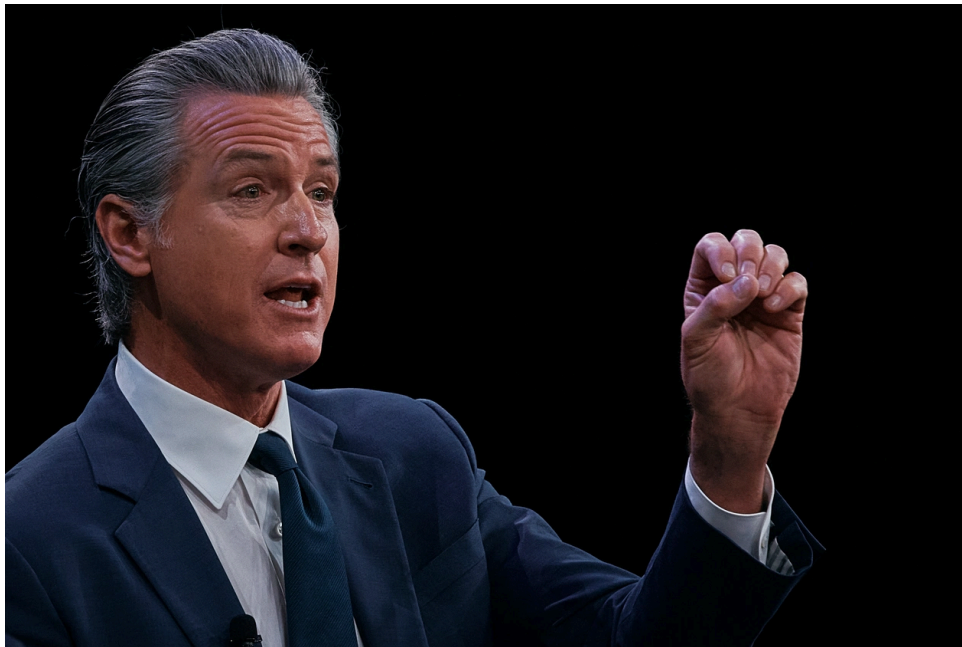
California Gov. Gavin Newsom speaks during the Clinton Global Initiative on Sept. 24, 2025, in New York.

The California governor's remarks come amid a federal government shutdown that has left Capitol Hill in a stand-off.