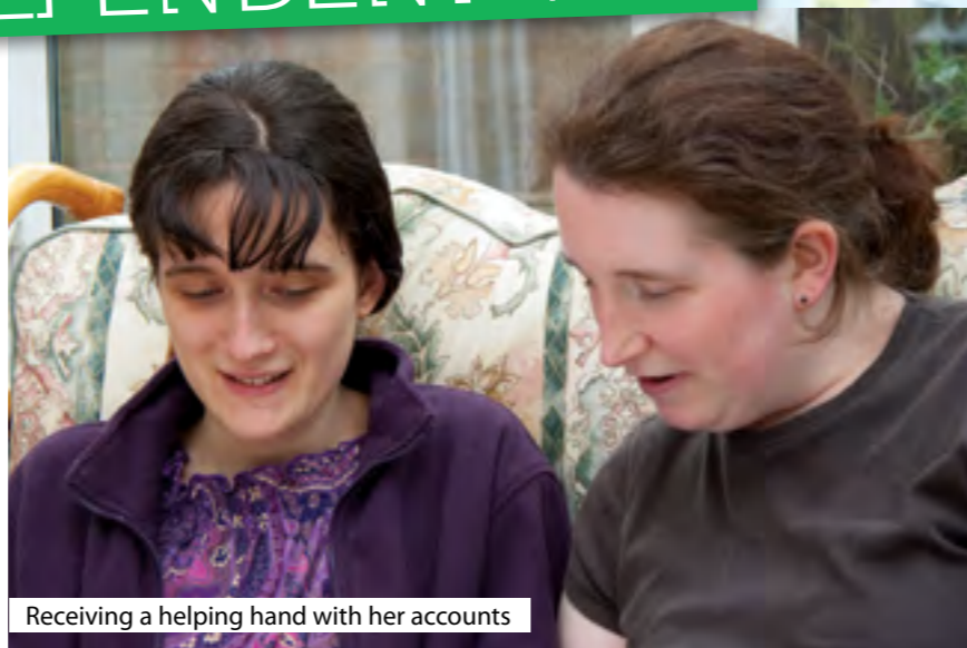
Receiving a helping hand with her accounts