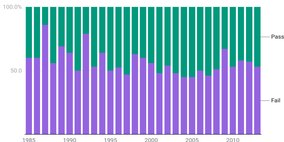
Chart: Irene Molina • Source: GitHub • Created with Datawrapper

Percentage of movies that pass the Bechdel test from 1985 to 2013