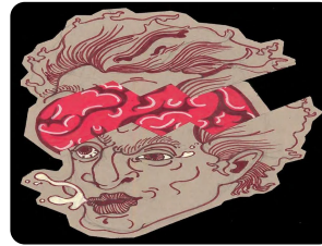
Forgetting the Dangers of Cont...