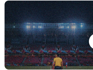
Technology in Sport: Killing t...