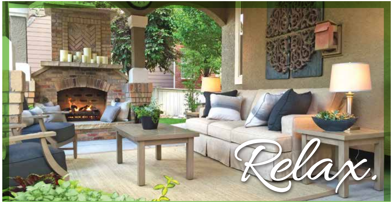
Let enviroscapes create your ideal outdoor living environment that is personalized to both your family and your home.