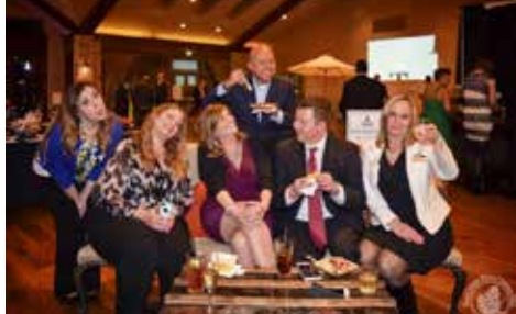
All our guests had fun!