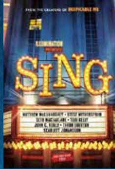
SING JUNE 24 • RATED PG

The Parker Area Chamber of Commerce is excited to announce the 2017 Movies in the Park event presented by Parker Adventist Hospital. This family friendly event is fun for everyone. Games, music, concessions and a movie all for FREE!