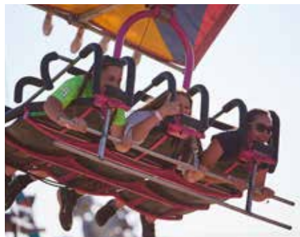
Up, Up & Away!