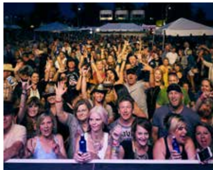
Everyone enjoying the Headline Concert