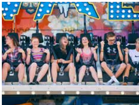
Kid Friendly Fun!