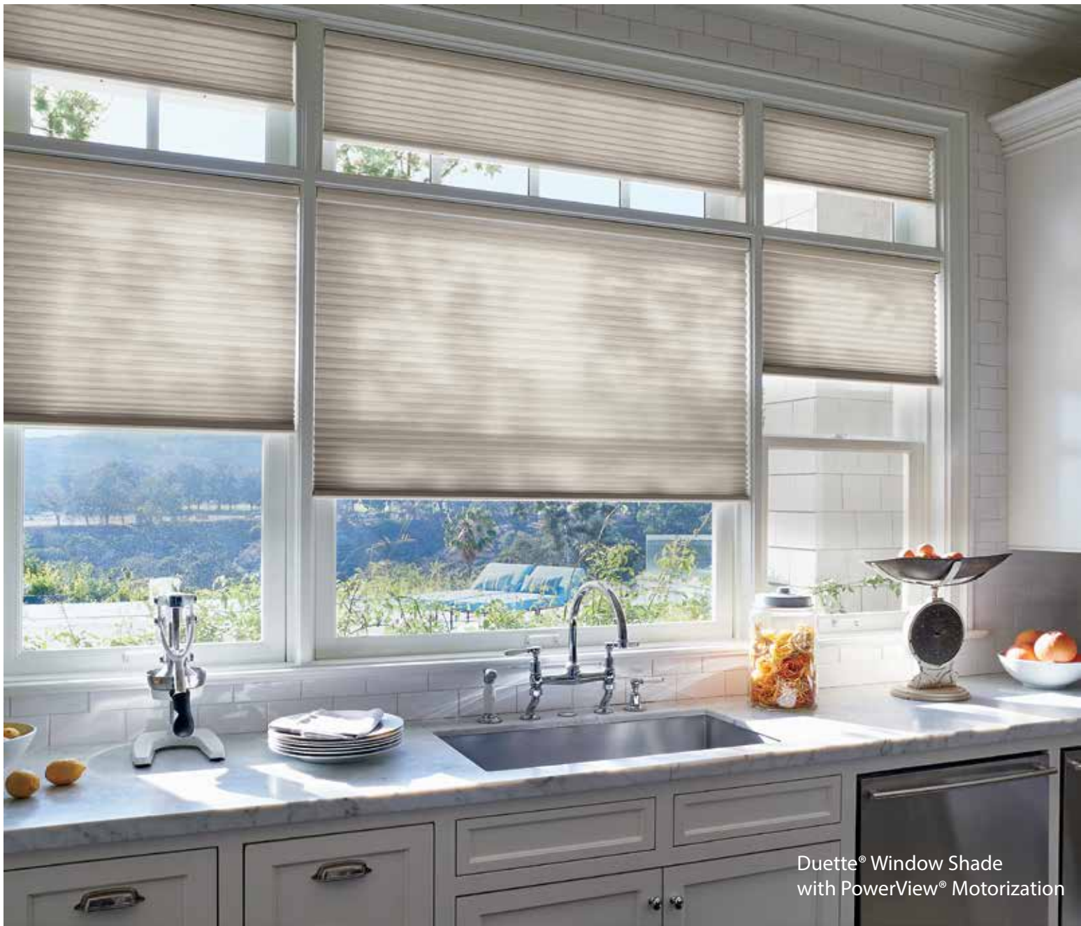
Duette® Window Shade with PowerView® Motorization