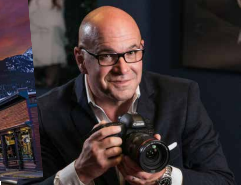
Favorite Holiday Destination - Telluride, Colorado