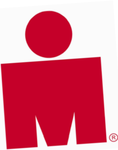
Most Treasured Item - Fin- ishing 9 Ironman Triathlons