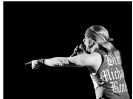
Bret Michaels performing