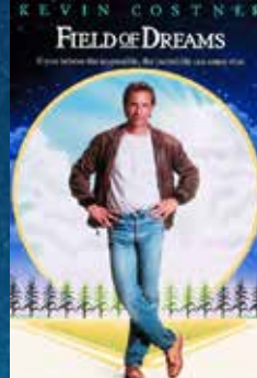
FIELD OF DREAMS JULY 15 • RATED PG