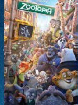
ZOOTOPIA AUGUST 5 • RATED PG