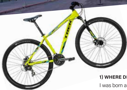
Favorite thing to do for fun - Biking in the Mountains