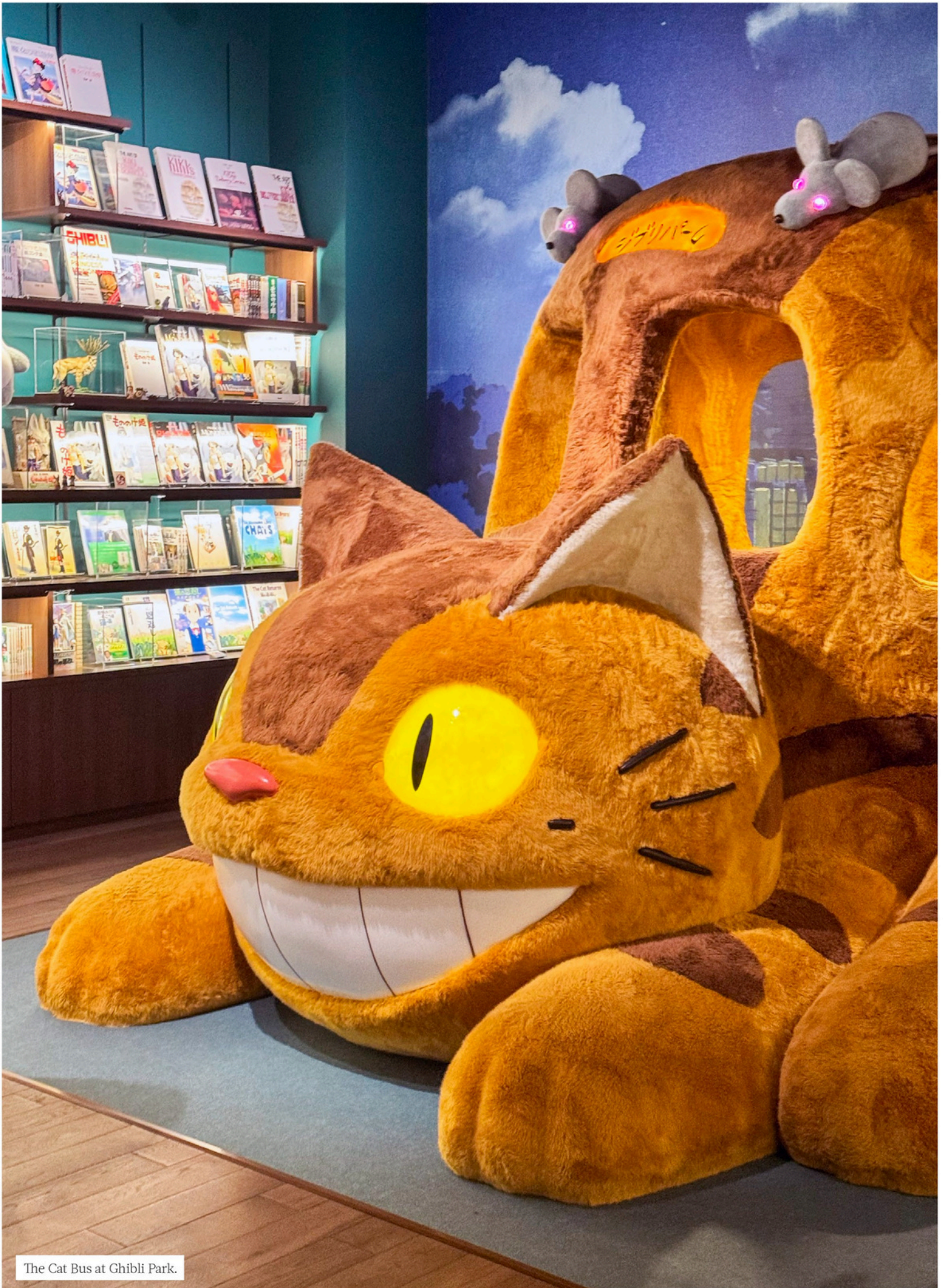
The Cat Bus at Ghibli Park.