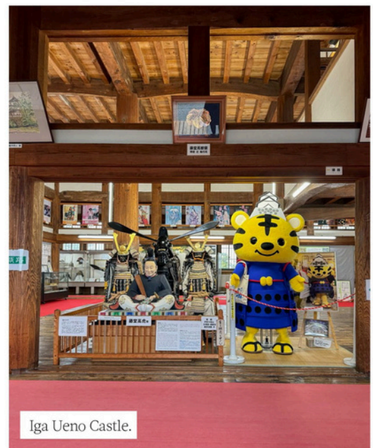
Iga Ueno Castle.

A short walk away, impressive Iga Ueno Castle, built in 1585, showcases artefacts such as battle-worn weapons and armour. It's renowned for its high walls, >>>