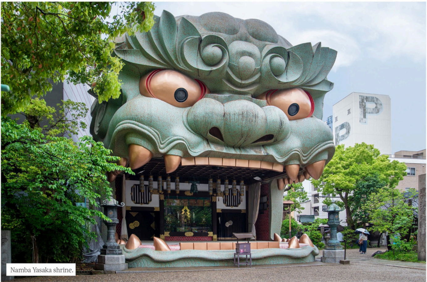
Namba Yasaka shrine.