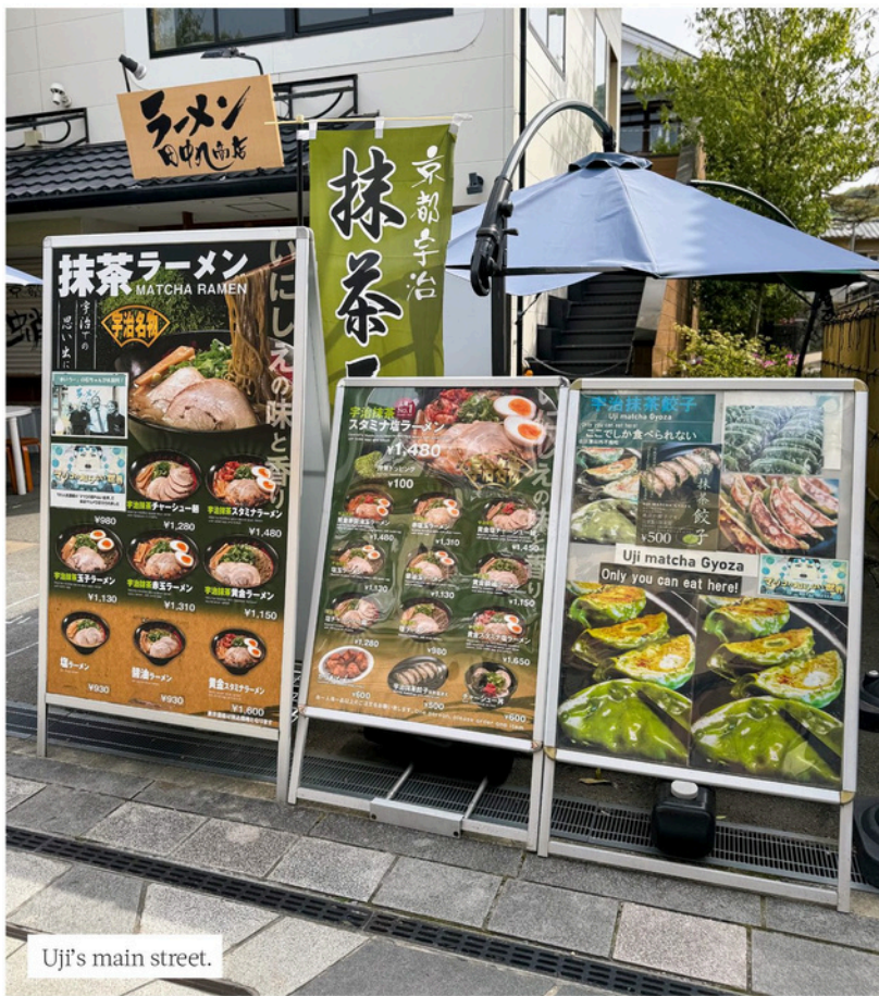
Uji's main street.