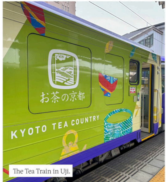
The Tea Train in Uji.