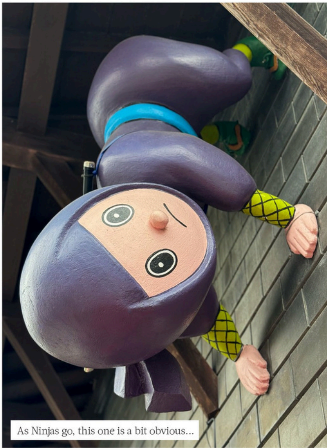
As Ninjas go, this one is a bit obvious...