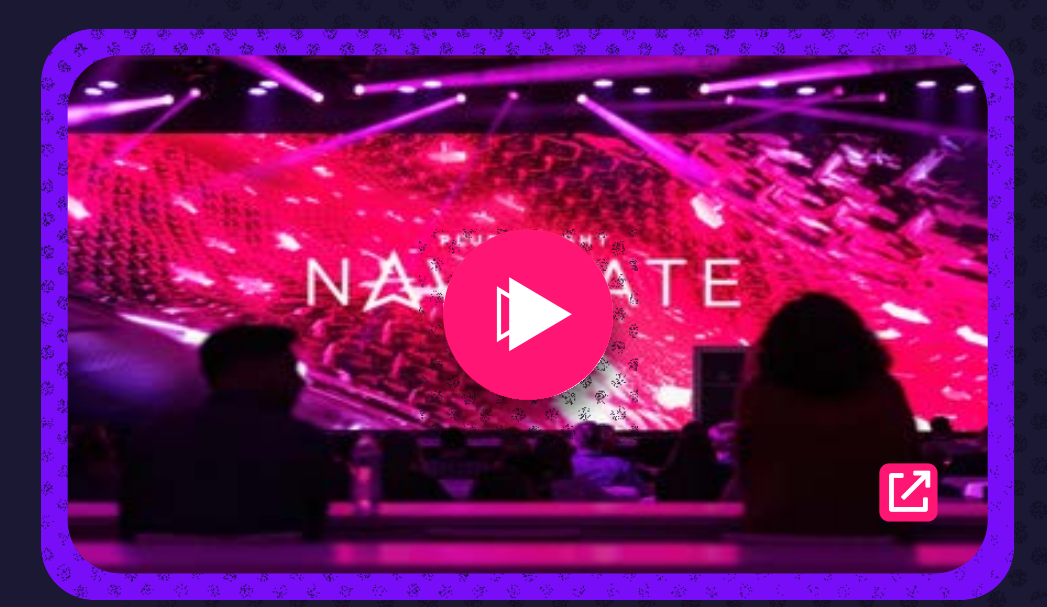
Navigate 2024 Highlights reel