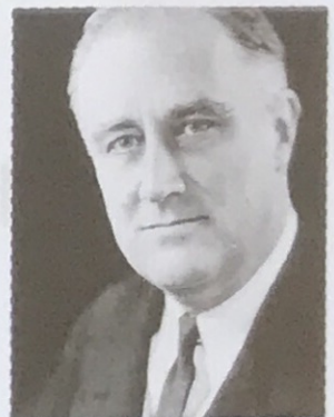
Above: Ward Circle Building Right: In 1934, President Franklin D. Roosevelt pledged his support for the School of Public Affairs.