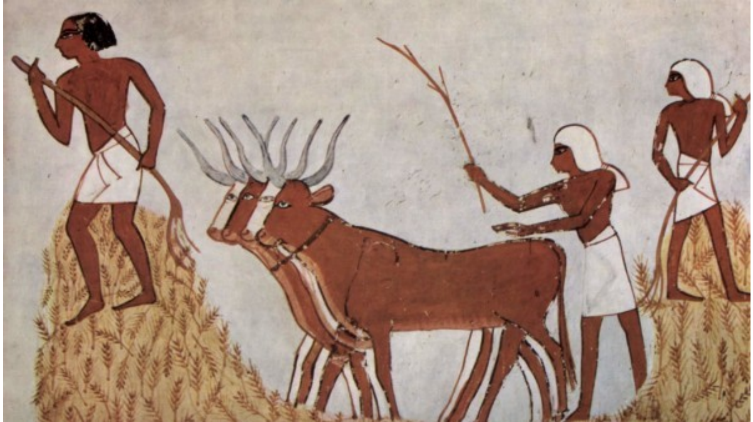
Photo credit: Maler der Grabkammer des Menna. Wikimedia Commons. Public domain.