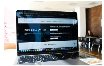
Changes to FAFSA will bring expanded eligibility and streamlined application process

Next Post: Climate change class to reduce dorm waste with Spring Swap event