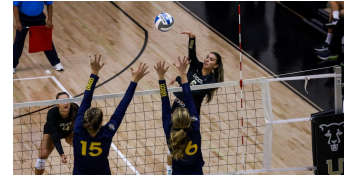
Mountain Lions concede another loss in RMAC Power Pod