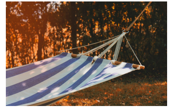
A hammocker's guide to Colorado Springs