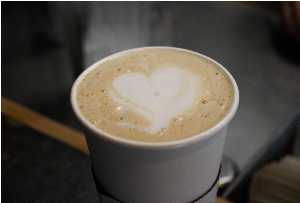
Latte art at Big Cat Coffee.