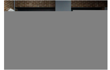
Meet the baristas of Big Cat Coffee