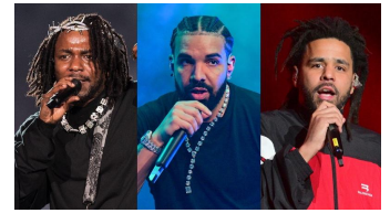
Breaking down the 'Big Three' rap beef of 'Might Delete Later'

Next Post: Breaking down the 'Big Three' rap beef of 'Might Delete Later'