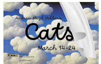
UCCS Theatre Company's "Cats" leans into surrealism of original production, added dates after last week's storm