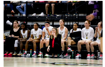
Sports Opinion | UCCS should have been selected for NCAA tournament