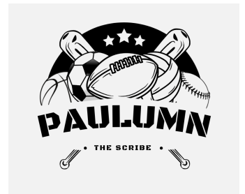
Sports Paulumn: The eight most intriguing March Madness matchups