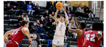
Men's basketball splits weekend of home games