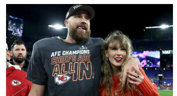
OPINION | Taylor Swift is doing the NFL a huge favor