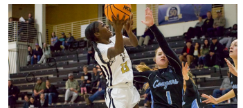
Women's basketball opens 2024 with consecutive home victories