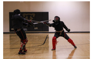
HEMA Club is bringing back the pleasure of swordplay