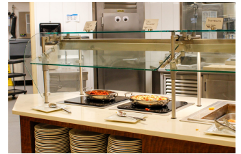
UCCS dining director leads culinary innovation