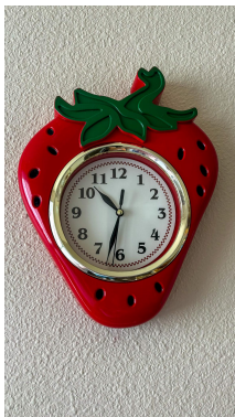
Strawberry wall clock.

As I look around my room, I see different items that could be categorized into some of the aesthetics listed above: the globe on my bookshelf is dark academia, the crocheted doilies beneath my potted plants are cottage core and the taper candles in the glass candle holders are coquette.