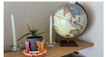
OPINION | Your home should be full of art and joy, not just aesthetic