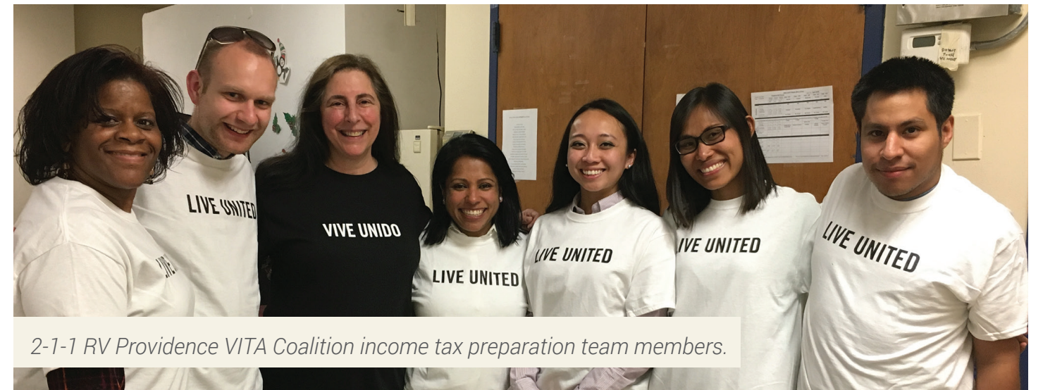
2-1-1 RV Providence VITA Coalition income tax preparation team members.