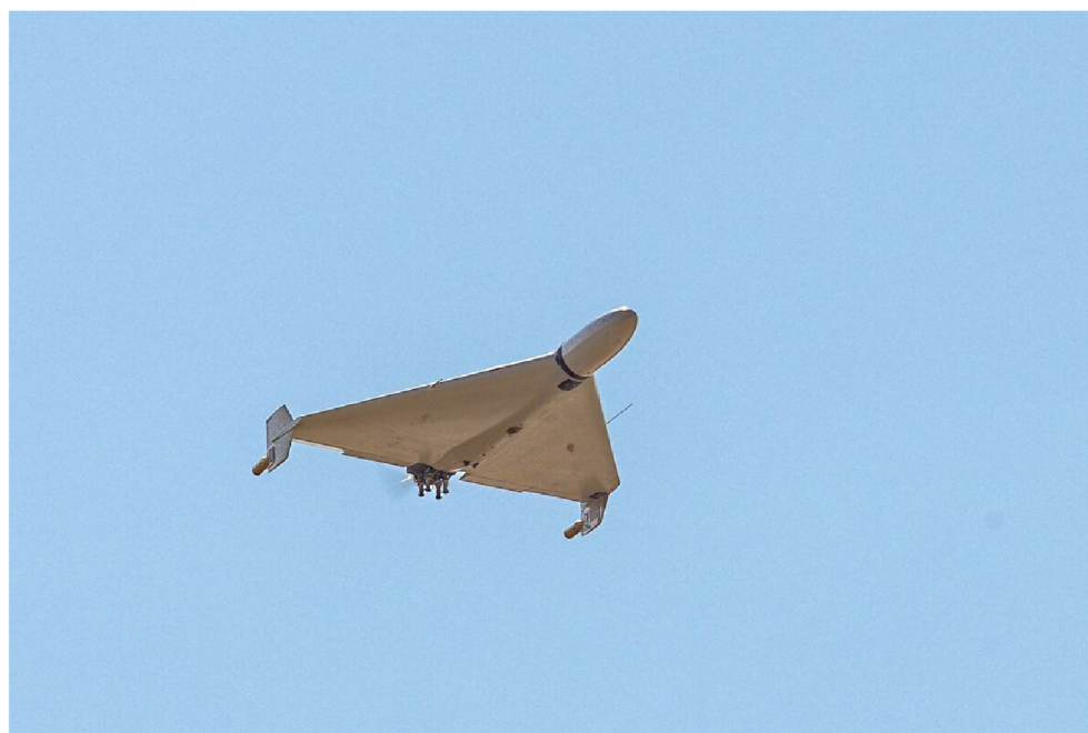
Iran-made Shahed-136 drone.

China seized a Taiwanese fishing boat and its six crew members near Taipei-controlled Kinmen island. Taiwan's coast guard called off a pursuit to avoid escalating the conflict, the AP reported. And Chinese and Russian firms are developing an attack drone .