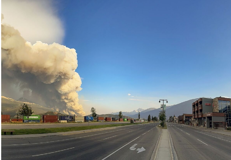
Smoke rises from a wildfire burning near Jasper, Alberta, Canada.

Rainfall is expected to bring some relief to a fast-moving, week-old wildfire that ripped through the Rocky Mountain resort town of Jasper, Canada. The fire damaged about half the town, but park officials said the forecasted rain will help keep fire activity low for the next 72 hours.